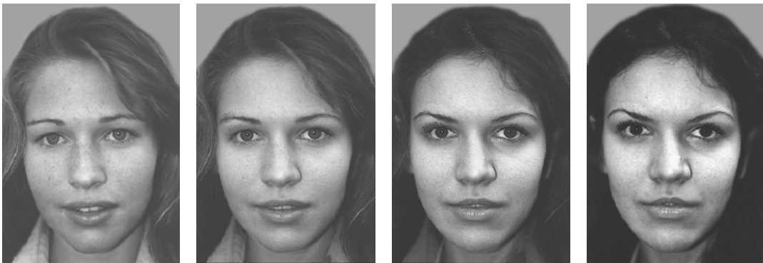
Figure 3: Example of a morph-pair used in Experiment 2.

Note. From left to right: parent face 1 (0%), 35% morphed face, 70% morphed face, and parent face 2 (100%)