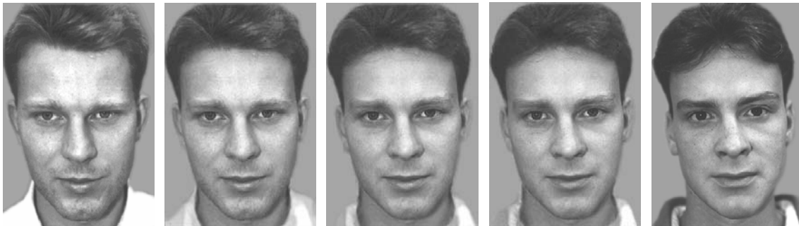
Figure 2: Example of a morph-pair used in Experiment 1.

Note. From left to right: parent face 1 (0%), 30% morphed face, 50% morphed face, 60% morphed face, and parent face 2 (100%)